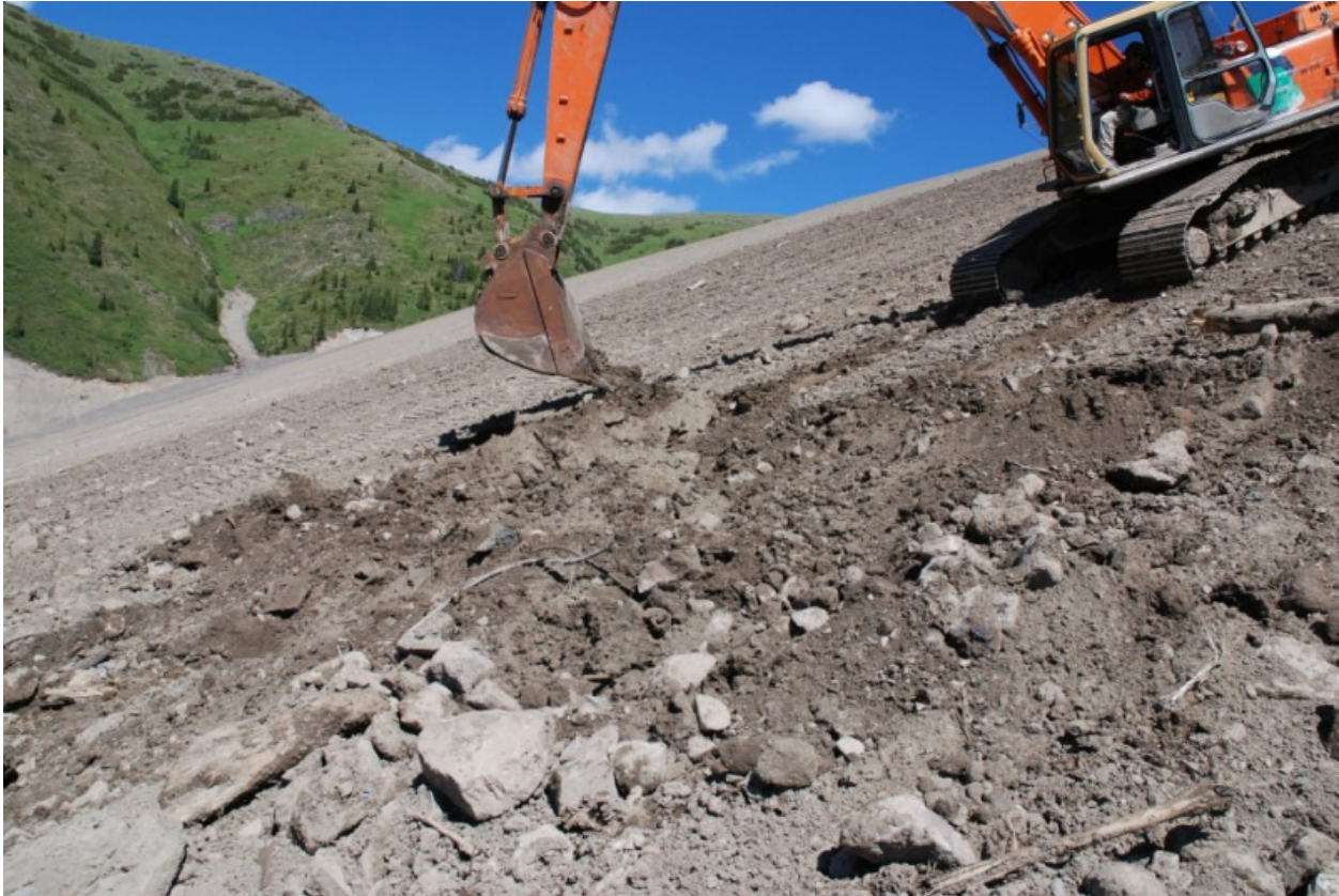
Photograph 1: Example of making a surface rough and loose