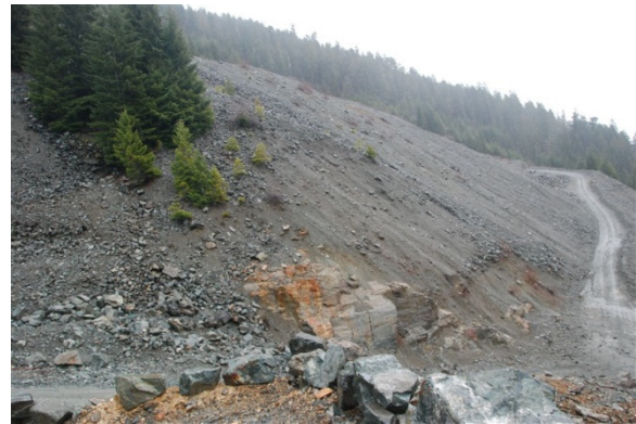
Photograph 2: Coarse textured waste rock could be obtained from the toe of WRD2 if it is non-PAG (left)