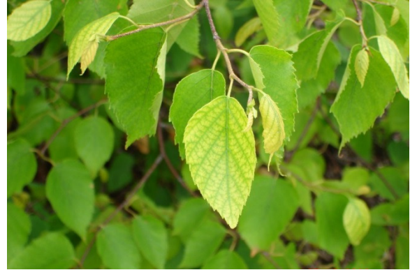
Photograph 5: Interveinal chlorosis in the vegetation at the Vale Mine in Sudbury, ON (right)

There are a wide variety of monitoring systems that have been developed; however, simple systems that can be understood by all are particularly useful as these can build confidence in the systems being monitored. In the case of the Myra Falls Mine site, establishment of transects through the restored areas with appropriately sized plots at regular intervals along the transect can be used. The transect should follow along the disturbed site so that uniform conditions are sampled. For instance, sampling along the treated Myra Creek would follow the shoreline of the creek. If circular plots that are 1/100 of a hectare (5.64 m in radius) are used, then the analysis of data allows simple comparisons based on a per hectare basis (Orloci and Pillar 1989). There is a benefit in marking the start of transects with a post that can be found in subsequent years as this will allow the same areas to be sampled repeatedly so that the progress of the restoration can be clearly documented. At each site, plot a complete list of the species present along with an estimate of their cover and abundance (Mueller-Dombois and Ellenberg 1974). This will allow the identification of any invasive species as well as the change in vegetation cover in the future.