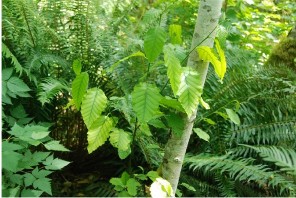
Photograph 4: Interveinal chlorosis in the vegetation at the Island Copper Mine in Port Hardy (left)